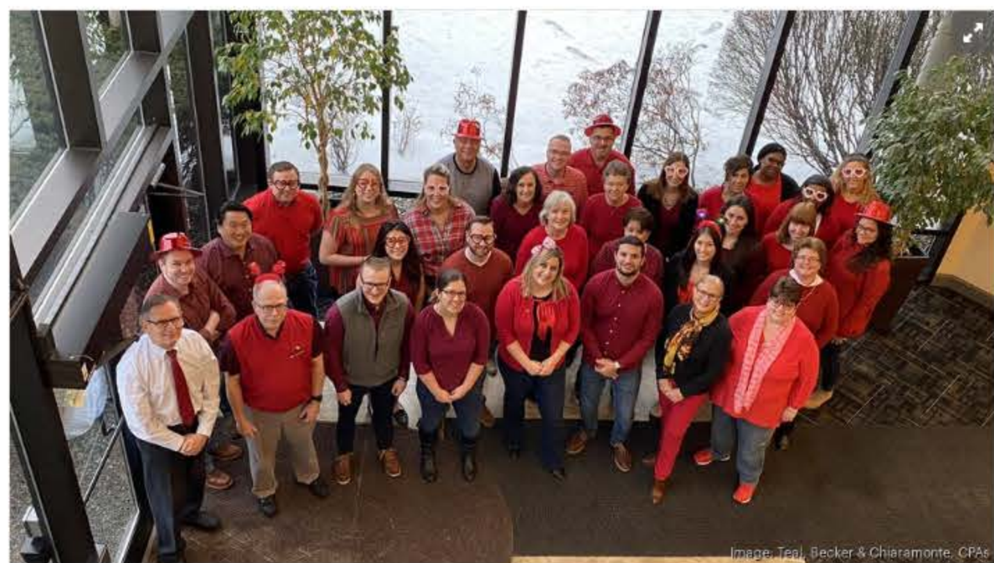
Teal, Becker & Chiaramonte CPAs is one of the Albany Business Review's 2025 Best Places to Work winners. TEAL, BECKER & CHIARAMONTE, CPAS