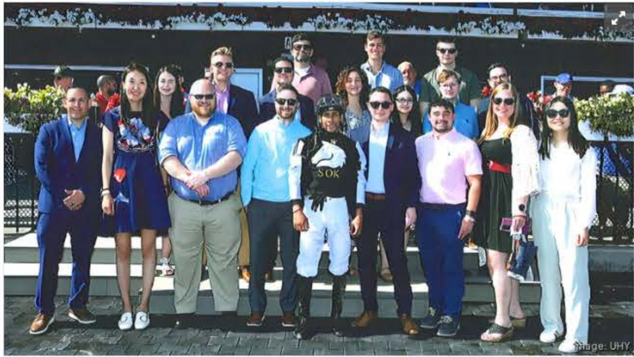
UHY is one of the 2025 Best Places to Work in the large companies category. UHY