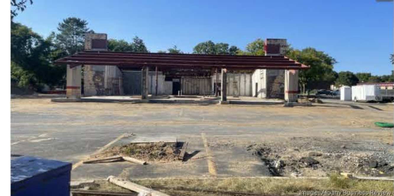
This former Denny's restaurant on Wolf Road is being converted into a Community Bank branch.