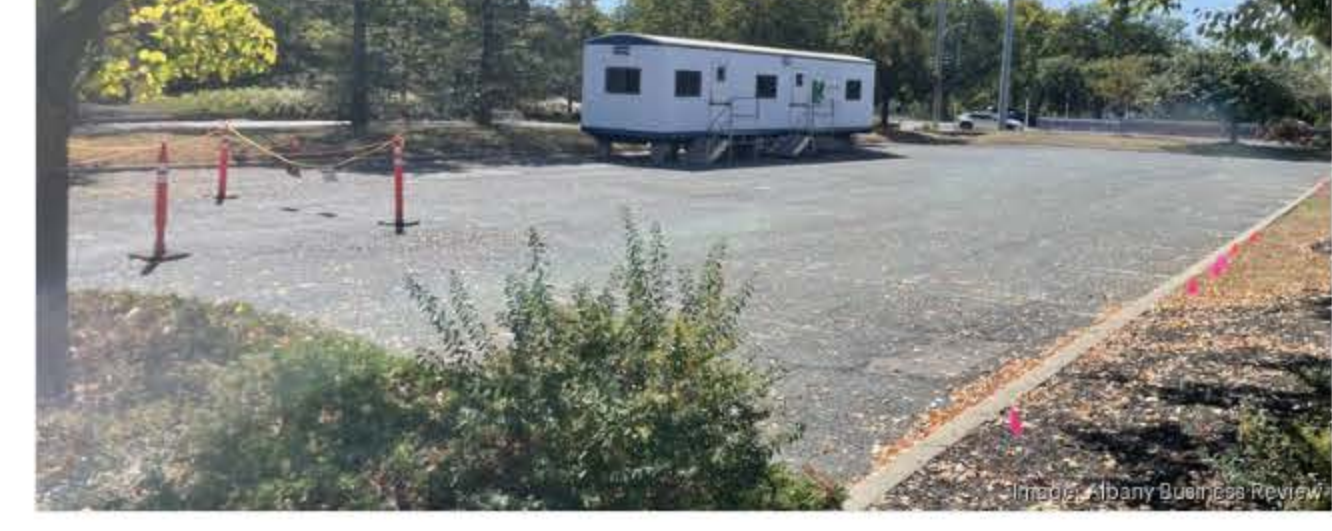
A LeChase Construction trailer near the site of Bank of America's planned branch at Colonie Center.

Construction started Sept. 22, according to KeyBank spokesperson, who said the bank is targeting a spring 2026 completion date.