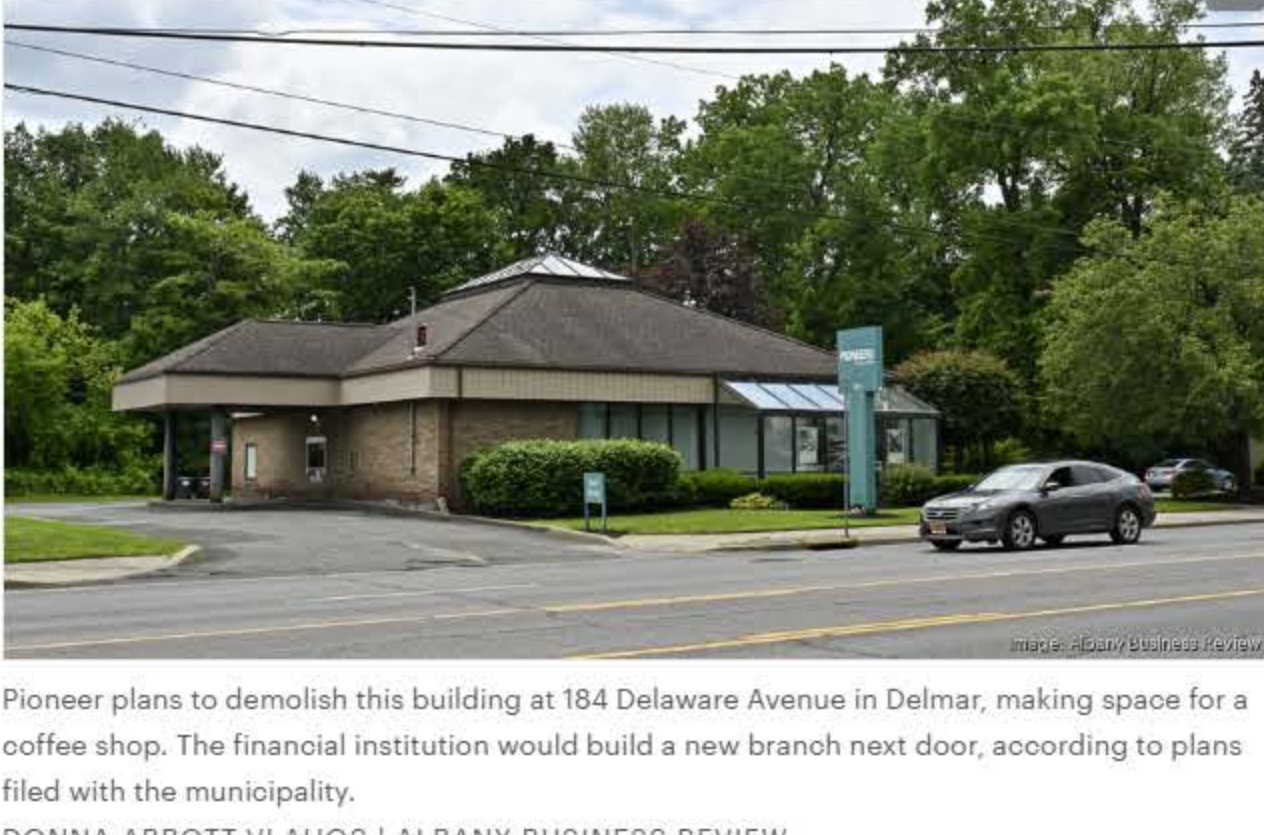
Pioneer plans to demolish this building at 184 Delaware Avenue in Delmar, making space for a coffee shop. The financial institution would build a new branch next door, according to plans filed with the municipality.

Unlock URL Order Reprints Gift this Article