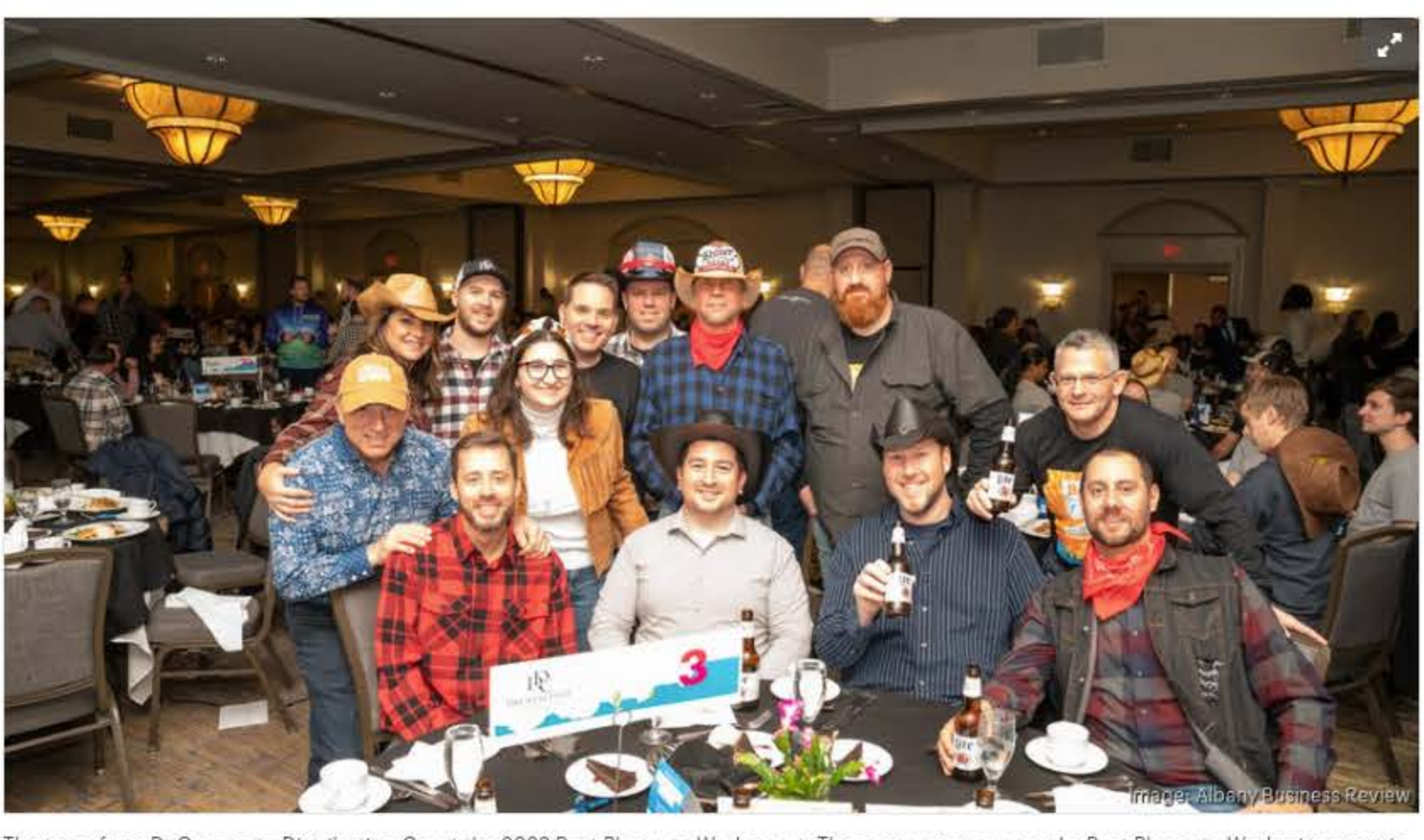
The team from DeCrescente Distributing Co. at the 2022 Best Places to Work event. The company was named a Best Places to Work winner again for 2023.