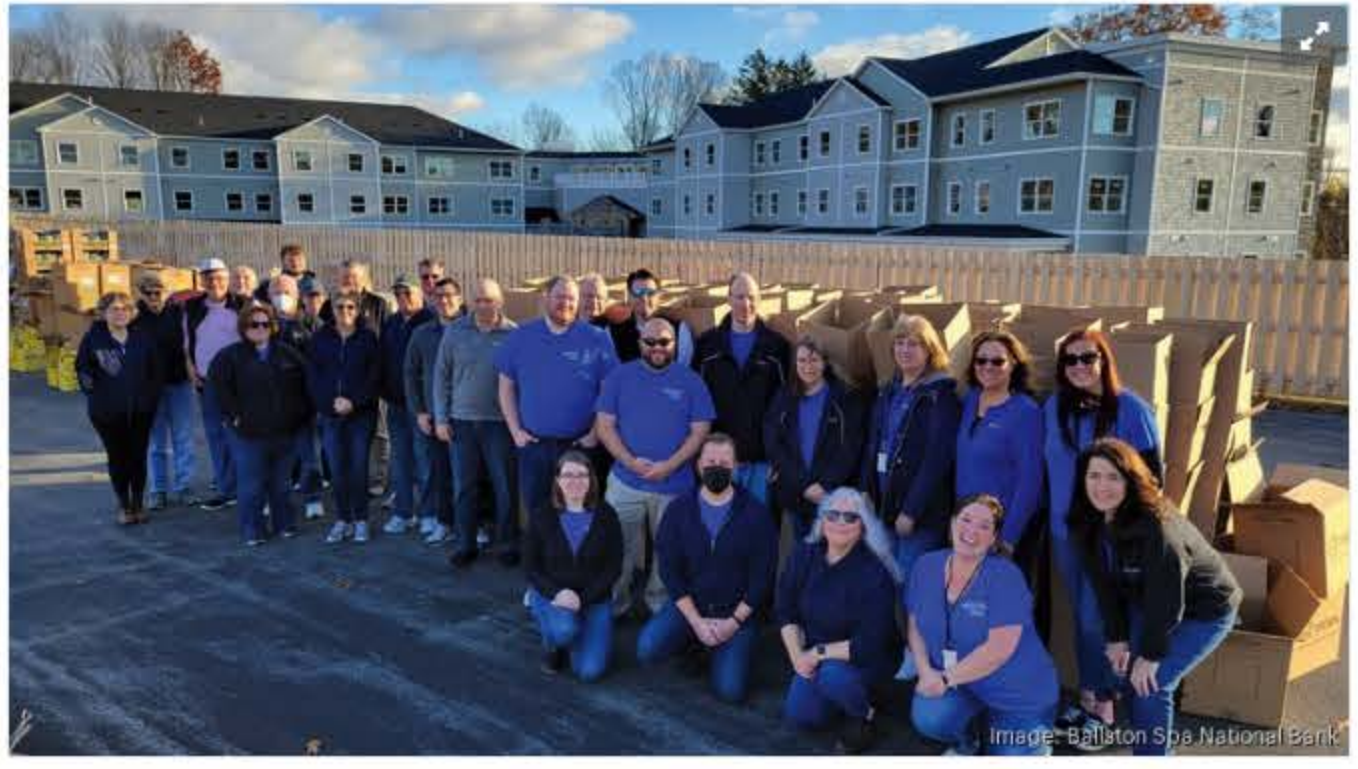
Ballston Spa National Bank is among the Best Places to Work winners in the large companies category for 2023.