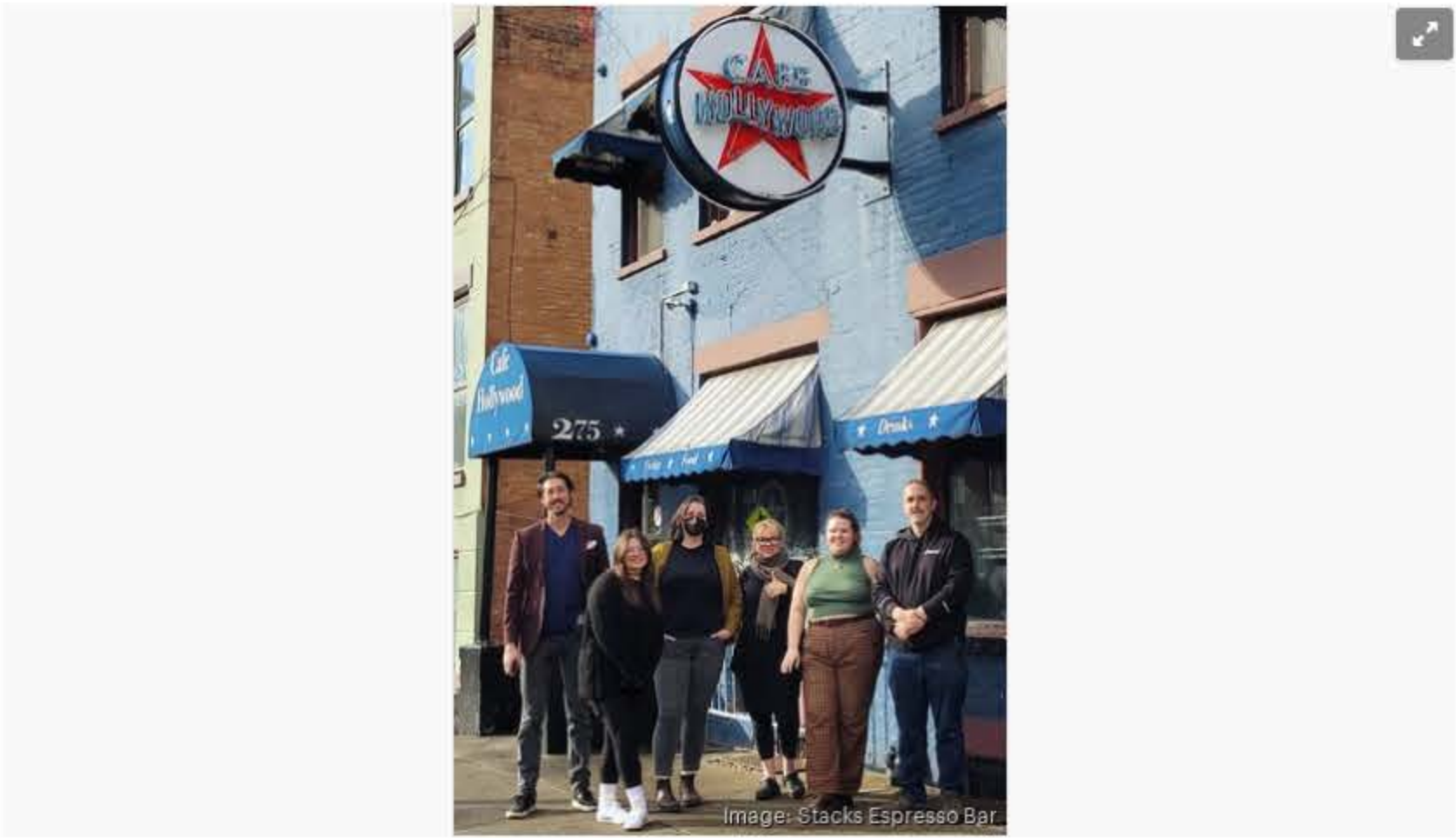
Stacks Espresso Bar will take over the former Cafe Hollywood building on Lark Street. STACKS ESPRESSO BAR